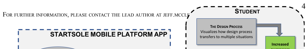
Figure 2 – Conceptual Framework

As shown in Figure 2, engaging in a STARTSOLE experience aids both the educator and student in component areas aligned to NSF’s Broadening Participation in Engineering (BPE) Program. The selection of an engineering-centric question initiates this process. A central hypothesis of the proposed research is that a well-crafted question can activate inquiry that leads the participating students in a direction that naturally invites engineering behaviors. A companion hypothesis is that knowledge of science and engineering, per se, is not a requirement of the novice educator to effectively facilitate a meaningful engineering experience that is scaffolded by STARTSOLE. Cognitive apprenticeship theory posits that the educator – aided by the STARTSOLE application – will support the student’s use of design processes in content areas that are meaningful and memorable to the student. Interactive coaching from the STARTSOLE application reinforces the student’s mimicry of the engineering mindset by highlighting the parallels between specific engineering professions and the problem/solution journey of the participating student. The set of questions developed by an engineering advisory group span a wide range of topics that are applicable across STEM and social sciences so that educators across these topics can all participate.